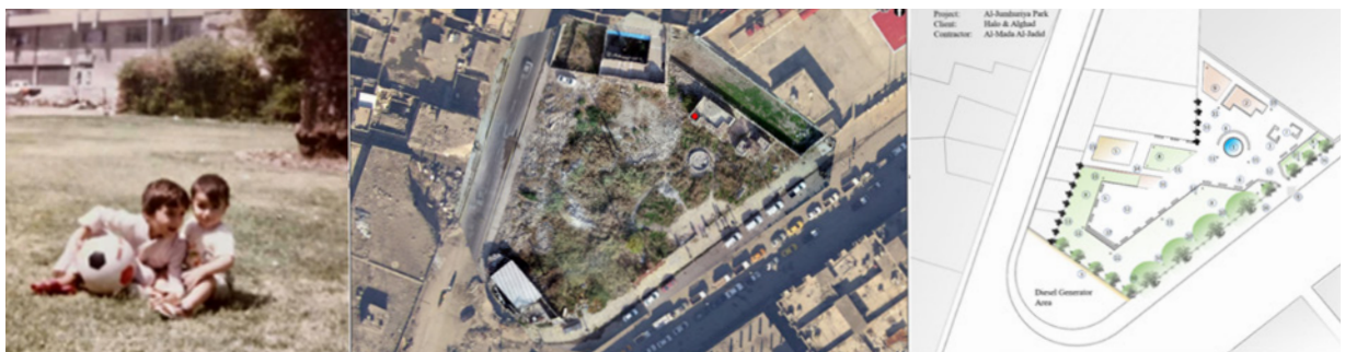
Figure 1. Visual tryptic representing the park’s pre-conflict, post-conflict, and peacebuilding character.

Not without challenges—on several fronts—before, during and post construction, the West Mosul Park project is a catalytic, yet sensitive, emotionally managed architectural work, and not merely utilitarian. Acknowledgment of lived experiences, negative and positive, allows the larger realities of complex socio-cultural dimensions of specific communities, in particular traumatised war-torn communities, to renew and evolve. Importantly, this is also landscape conservation architecture at work, and nature has been increasingly recognised as being at the heart of our sense of place in the world. This redesigned and rebuilt park becomes the iconic site for both remembering and healing of rifts, providing safe ground outdoors that “offers a sense of belonging, identity and social reassurance.” (Hay 2021, 9)