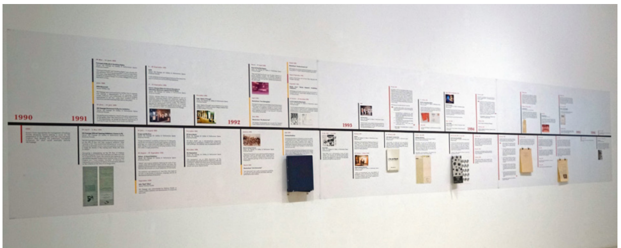
Figure 4. Timeline in the exhibition 5 th Passage: In Search of Lost Time , September 2021.

A real figure of real terror in life, nearly 800 years after his death, Genghis Khan is re-visited in a monumental sculpture, erected in 2008 in Mongolia, 54 kilometres from Ulaanbaatar—cultural memory cast in 250 tonnes of stainless steel, 40 metres high. Ironically, even brutal global military conquests can be a source of pride to the people who claim shares in belonging and birthplace.