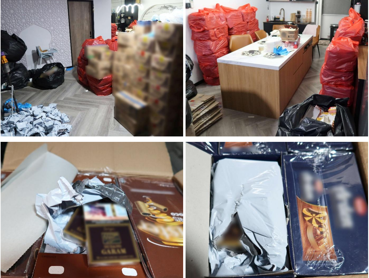
Duty-unpaid cigarettes found in a residential unit in Choa Chu Kang.