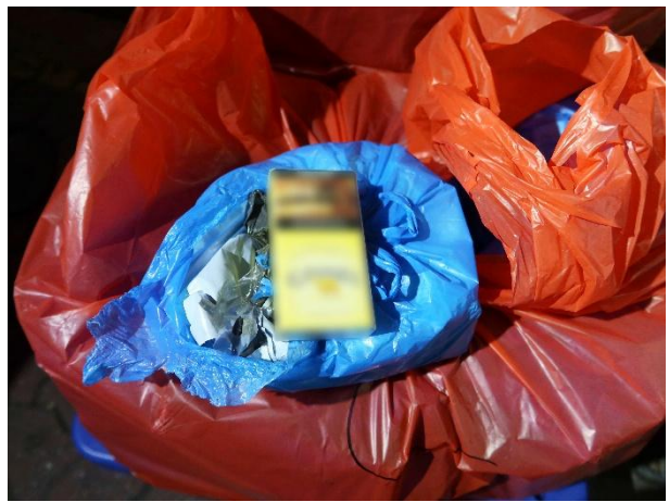
Duty-unpaid cigarettes found in a car in Tampines.