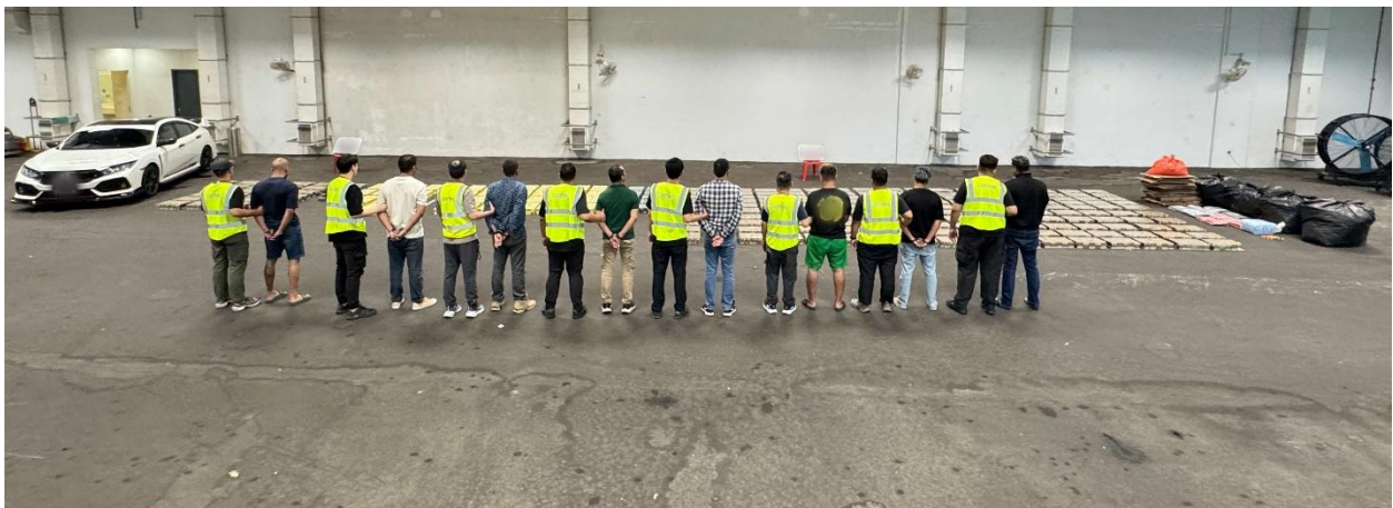
Eight men were arrested, and the duty-unpaid cigarettes as well as the car used to transport the illicit goods were seized.