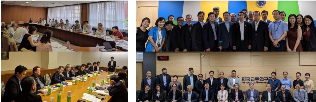
(Left) Meetings with Kyoto and Hyogo Prefectural Governments; (Right) AMAP delegation with representatives from Seoul Metropolitan Government and Korea Transport Institute

Both our Japanese and Korean counterparts shared with the Panel that they were similarly trying to figure out how to deal with the new trend towards active mobility devices, and that they saw Singapore as a leading authority on active mobility device regulation.