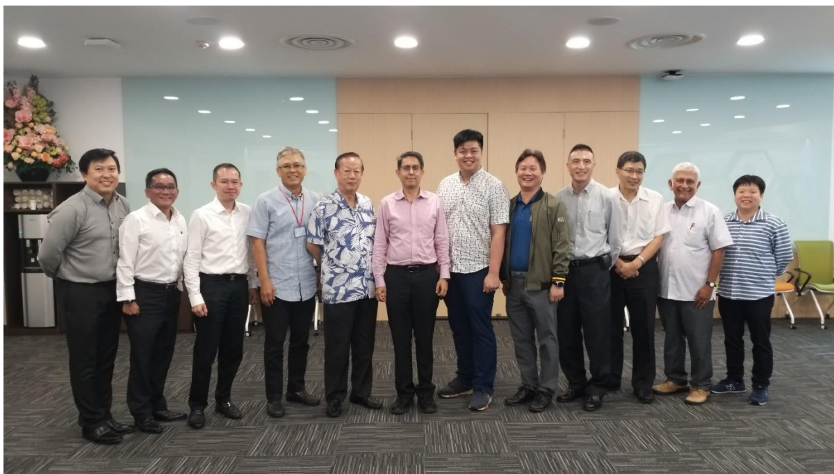
Members of the Active Mobility Advisory Panel