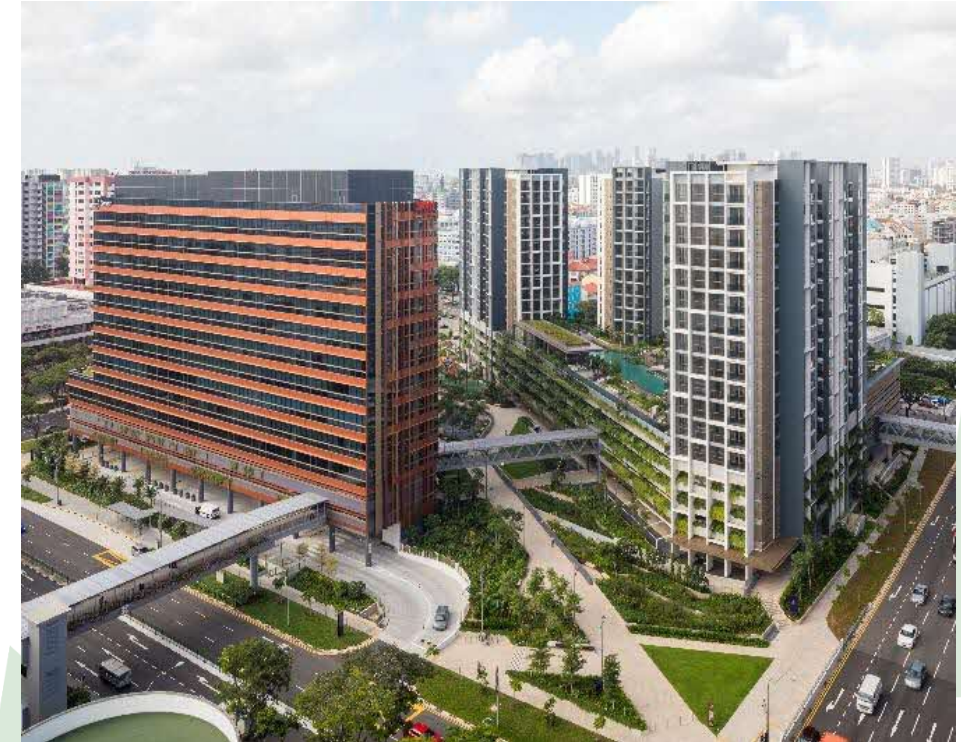
Overall view of the PLQ precinct with PLQ 3