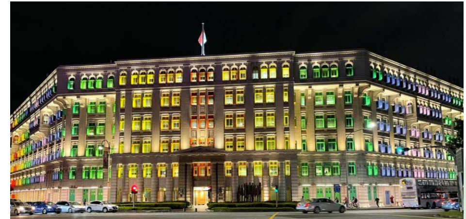
Ministry of Communications and Information at Old Hill Street Police Station

The eco-friendly LED lights are being used to light up the exterior of the building.