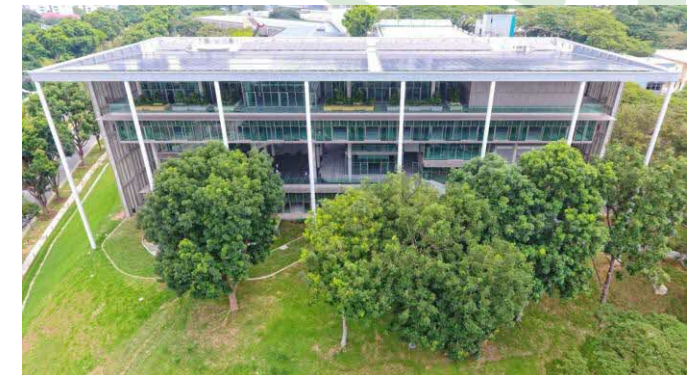
SDE4 - Platinum Zero Energy