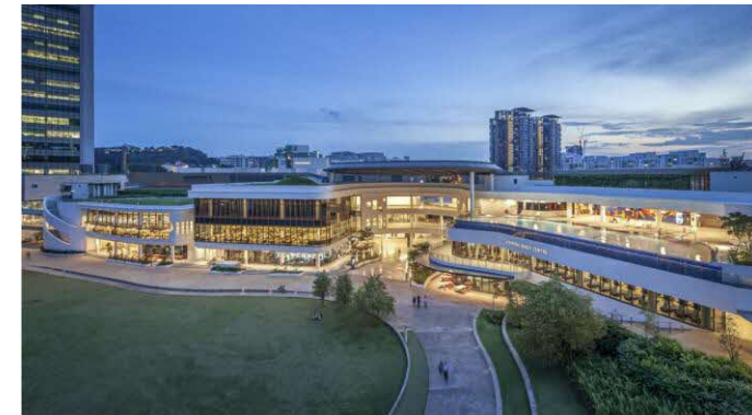
NUS UTown Green District Design - Gold PLUS