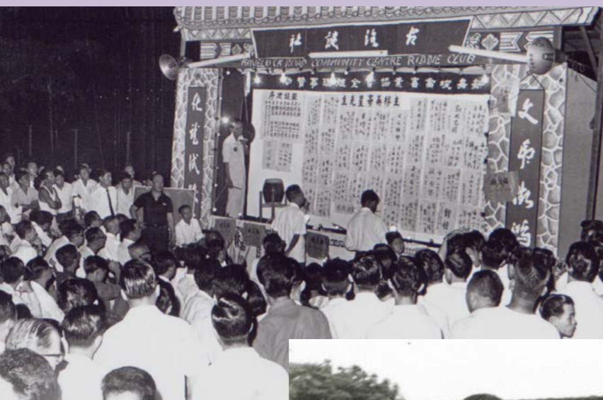
(Above) Chinese riddle competition organised by Havelock Road Community Centre Riddle Club at the agricultural show, 1965.

The agricultural show was only one of the attractions of the event. Variety shows were staged at the far end of the park, near the seafront, while Chinese wayang (operas) were performed on a smaller stage nearby. Other forms of entertainment included band performances, a mini zoo, an amusement park for children, a Chinese riddle competition and even a Chinese chess competition. Visitors also participated in a lucky dip. There were vegetables, fruits, eggs and poultry sold at lower prices, and hawker stalls and restaurants offering special dishes and delicacies. 10