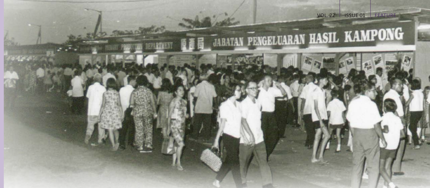
The agricultural show from 18 to 26 September 1965 drew an estimated 300,000 visitors.