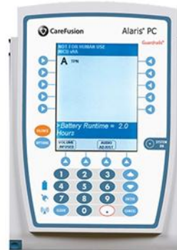
4.7" Small Screen LCD

Material Numbers: 8015LSBIXEN9121; 8015LSAIXE9121; 8015LSCIXE91240; 12279909.