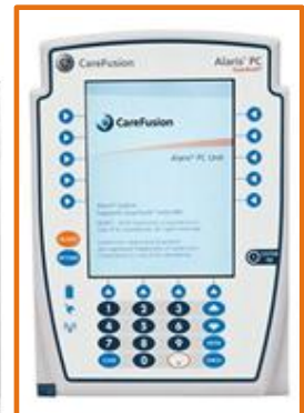
5.7" Large Screen LCD