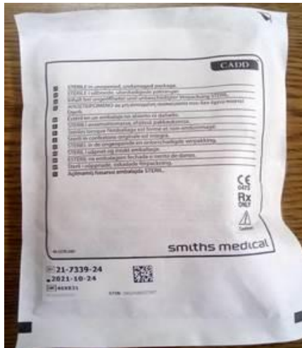
FIGURE 2-Front of Pouch