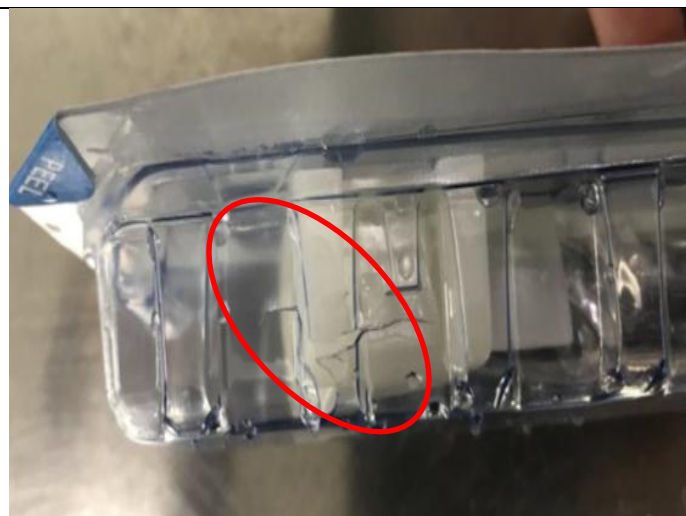
Fig 2. Inner Tray cracks near the plug