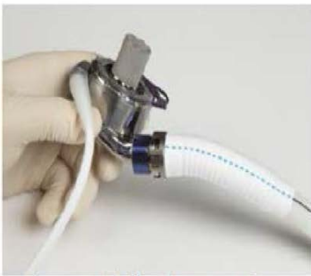
Correct: Fully Connected