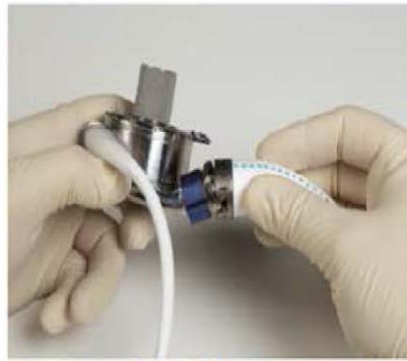
Incorrect: Not Fully Connected