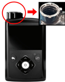
Image: Location of the retainer ring on the MiniMed™ 600 series insulin pump

The images show a normal pump retainer ring vs a damaged or missing pump retainer ring.