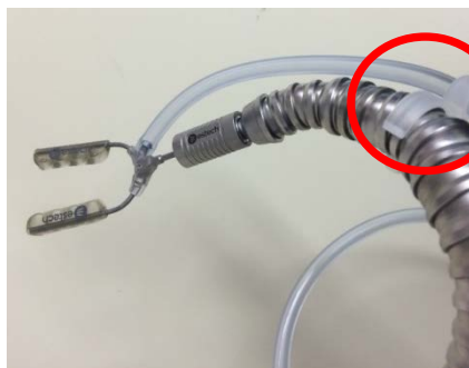
Titan Stabilizer attached to Hercules™ 3 Universal Stabilizer Arm (Suction Tubing Clip on right).

If a Suction Tubing Clip breaks and fragments fall into a patient's body cavity during surgery, the event could lead to a delay in the procedure as the surgeon retrieves the component. This could be complicated by the fact that the clip fragments may have sharp edges and are not radiopaque.