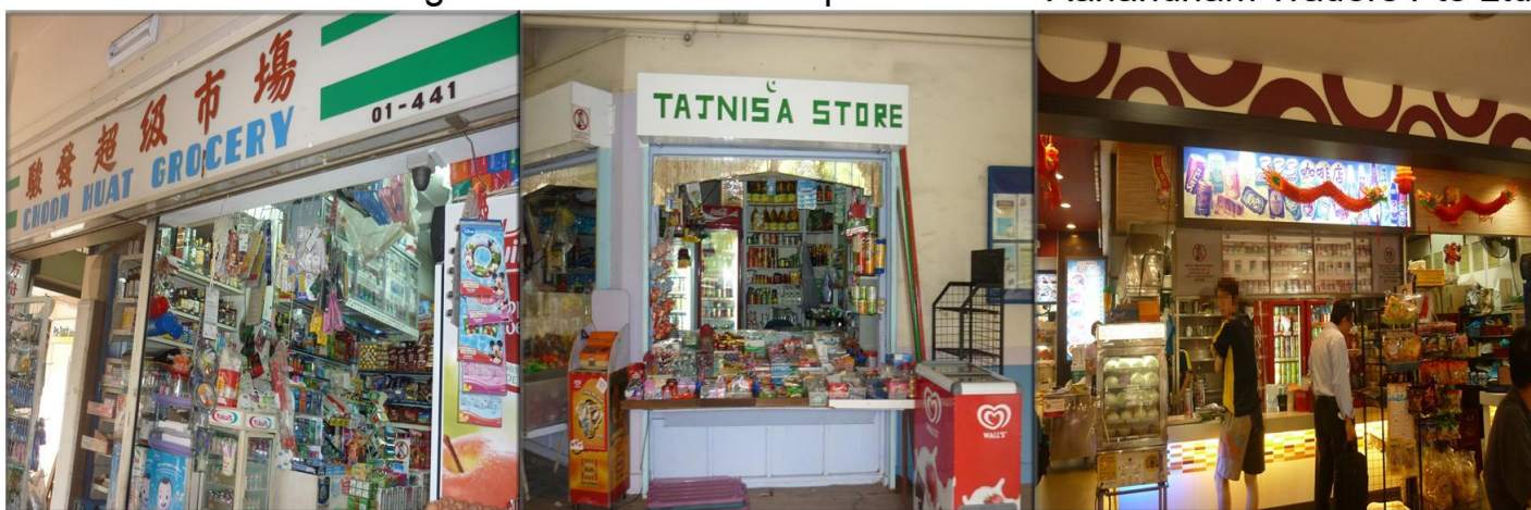
Choon Huat Grocery