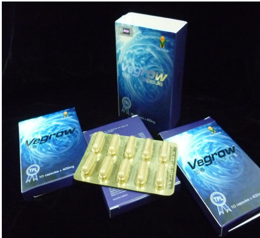
Picture of 'True ProLife Vegrow capsule 回春'