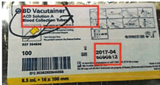
Figure 1. Shelf Pack (ACD Label)

BD has confirmed that a portion of SPS tubes associated with the above referenced product were incorrectly labeled at the case and shelf pack level. Impacted product will have incorrectly labeled SPS tube packaging that includes a label for ACD tubes catalog number 364606, BD Vacutainer® ACD Solution A Blood Collection Tubes 8.5mL • 16 x 100mm (see Figure 1 below). The ACD tubes label will also reference lot/expiry details associated with the SPS tubes. The correct shelf pack label for the SPS tubes, catalog 364960, is indicated in Figure 2 .