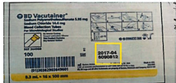
Figure 2. Shelf Pack (SPS label)

IMPORTANT: ALL SPS/ACD labels with LOT 6090812 MUST BE RETURNED