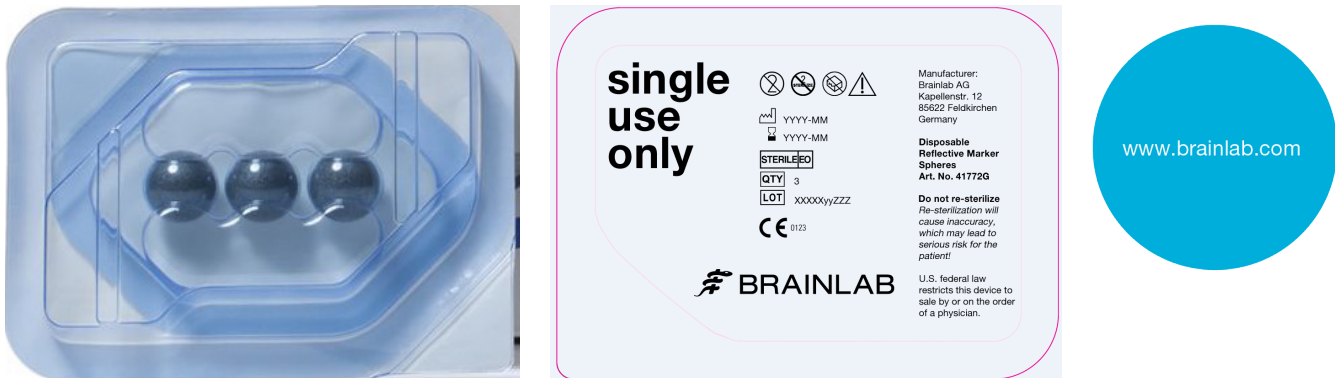
Figure 1: Example of label on the back of the Brainlab DRMS blister pack (Art.No. 41772G, 3 pcs of DRMS spheres)