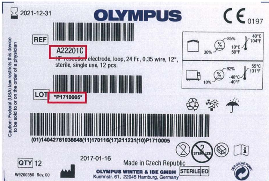
Picture 4: Model (REF) and lot (LOT) number on the outer packaging label