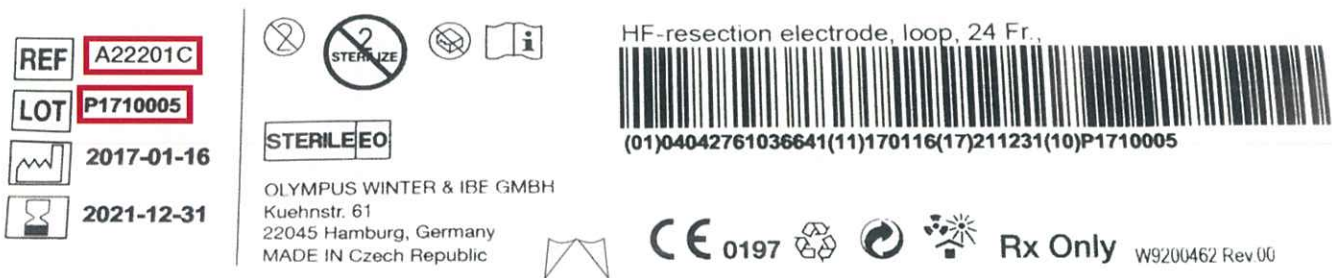
Picture 7: Model (REF) and lot (LOT) number on the blister packaging label