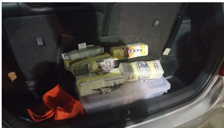
Bundles of sleeping pills wrapped in newspaper uncovered from the vehicle