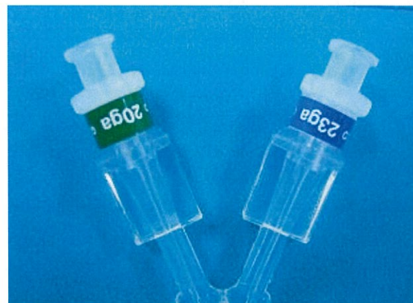
Fig. 1b. On the product (catheter hub)

Our records indicate you have purchased some units of the affected catheter kit(s), and we want to ensure that you are notified of this issue.