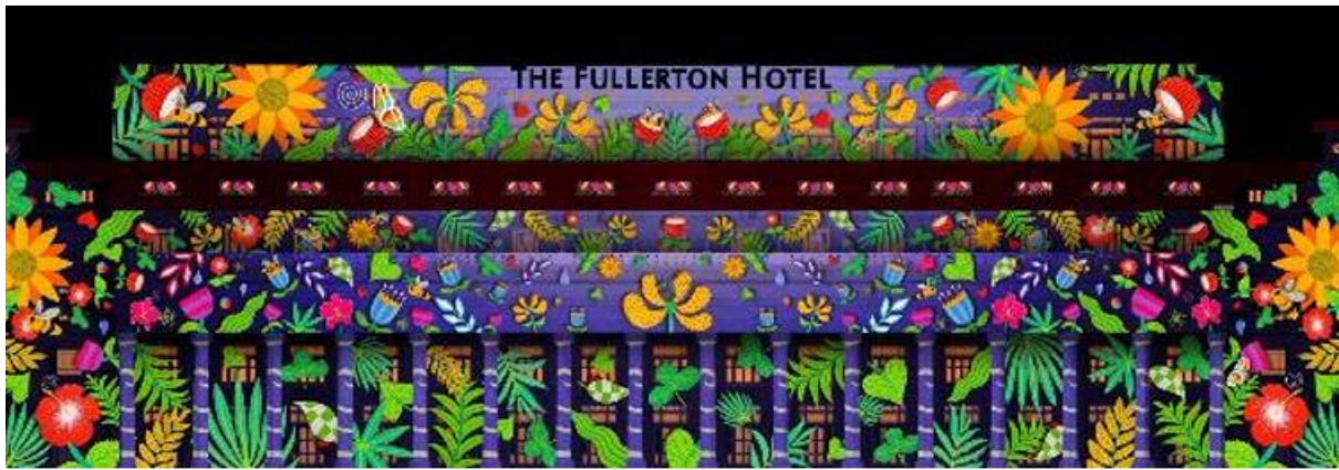
Artwork: Towards A Sustainable Future