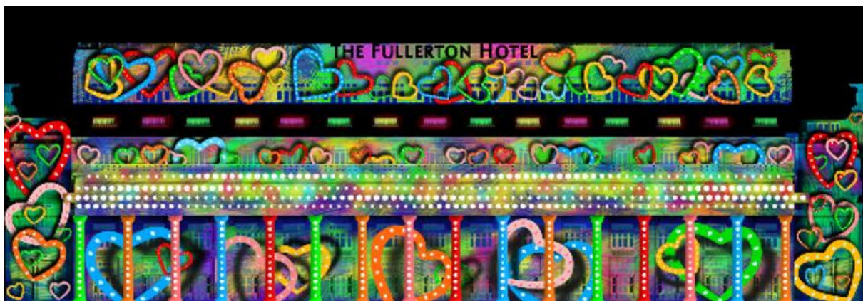
Artwork: Love Is In The Air