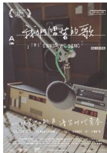
Feature film: The Songs We Sang

Ah Gong loves his songbird, Cheepcheep, very much.. but is it perhaps too much?