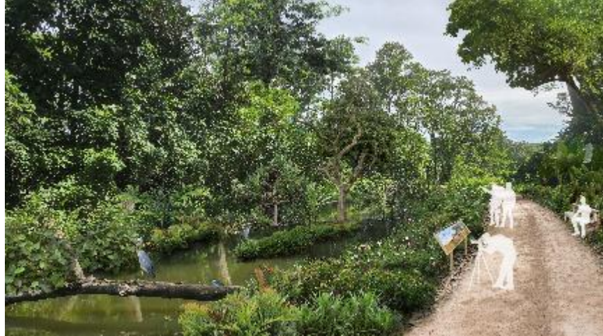
Artist's impression of the future park at Sungei Pang Sua

Future parks at Sungei Pang Sua (approximately 10 ha) and Kranji Reservoir (approximately 26 ha) [Under study]