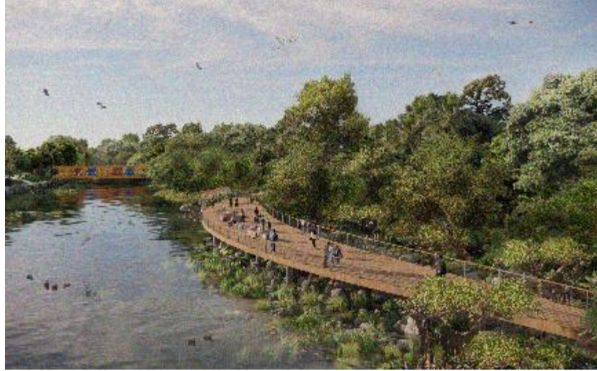
Artist's impression of the future naturalisation of Sungei Mandai

Naturalisation of Sungei Mandai (approximately 5 ha) [Under study]