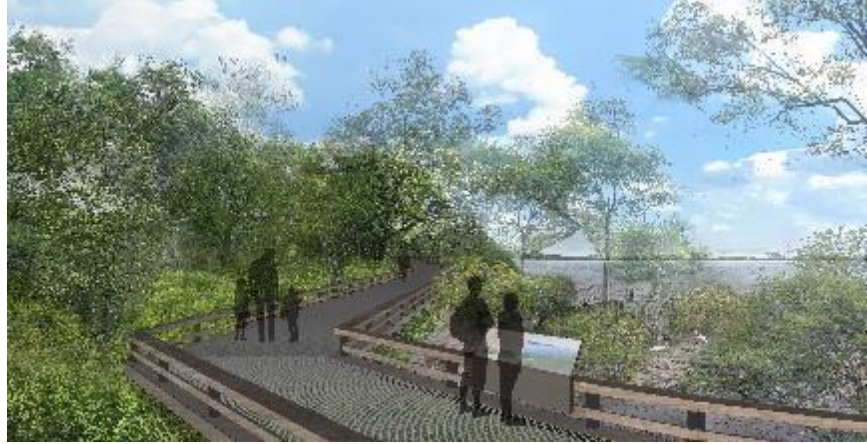
Artist's impression of proposed coastal trail at upcoming Mandai Mangrove and Mudflat Nature Park

Part of the Sungei Buloh Nature Park Network, this upcoming nature park will enhance Sungei Buloh Wetland Reserve's ecological capacity in mangrove and shorebird conservation. Its extensive mudflat exposed at low tide serves as an important feeding ground for shorebirds, making the site an ecologically inter-dependent habitat with the Reserve. Nature-based solutions to restore and reinforce the shoreline and support mangrove regeneration and habitat re-creation will be featured in this upcoming nature park.