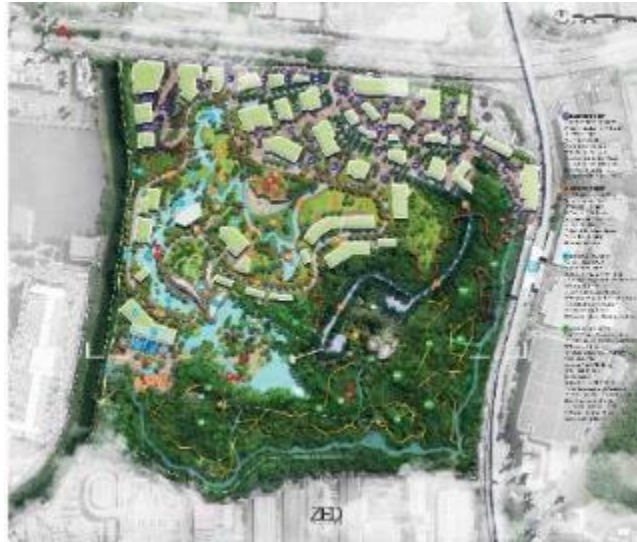
Illustrative site plan

25. The proposal aims to establish an inclusive regional hub for work, leisure and heritage, fostering connections between the natural environment and the surrounding industrial ecosystem. Connecting back to the site's history as a bird park, the proposal plays on the concept of four nests — Business, Recreation, Adventure and Heritage.