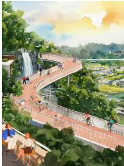
The Mobility Ribbon weaving the districts

34. The retained waterfall aviary in The Cave connects to The Wetlands, supporting a dynamic ecosystem that nurtures biodiversity. Unique elevated pathways that take advantage of the site's steep terrain connect The Cave to The Cliff and the future Jurong Hill MRT station, offering varied experiences for pedestrians and cyclists.