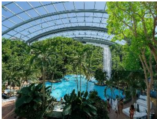
Wellness facility within the former Waterfall Aviary

10. Leveraging its proximity to NTU and industrial hubs in the west of Singapore, the Innovation Zone is envisioned as a hub for emerging businesses. Intensified office buildings are located closer to the AYE to buffer the communal spaces within from noise. Sungei Lanchar integrates nature-based retention ponds and stormwater solutions with a sunken seating area to form a multi-functional 'living room'. The Innovation Zone also includes amenities like restaurants to foster community bonding and support the wider Jurong Industrial Estate.