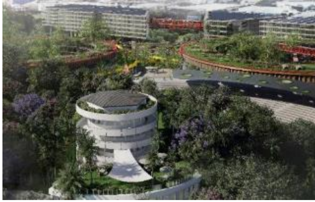
Jurong Hill Tower remains an icon atop Jurong Hill

24. The proposal celebrates site's heritage through an Industrial Living Museum housed in the iconic Jurong Hill Tower and refreshed Garden of Fame. Spaces like the People's Theatre are also introduced to host community gatherings and outdoor screenings.