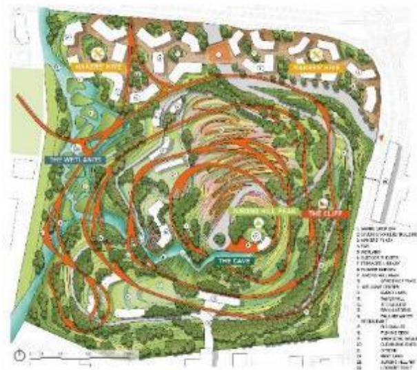
Illustrative site plan

Jurong Hill Experience Park transforms the site into a nature-integrated destination. The Wetlands naturalises Sungei Lanchar to create an extensive wetland ecosystem, the Makers' Hive introduces an industrial-led community space with flexible studios for collaboration, and the Cave houses the former waterfall aviary and is connected to The Cliff and the future Jurong Hill MRT station via elevated paths that make use of the unique terrain. Within Jurong Hill Peak, Jurong Hill Tower is reactivated to host cultural and recreational spaces. An elevated pathway called the Mobility Ribbon weaves through the five areas, providing universal access for cyclists, pedestrians and other mobility users.