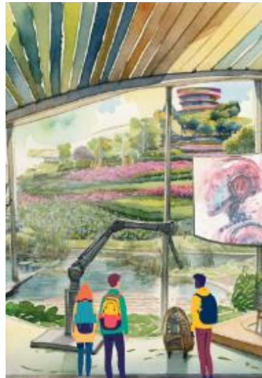
Makers' Hive overlooking Jurong Hill Tower

The Cliff, The Cave, and Jurong Hill Peak), providing universal access for cyclists, pedestrians and other mobility users.