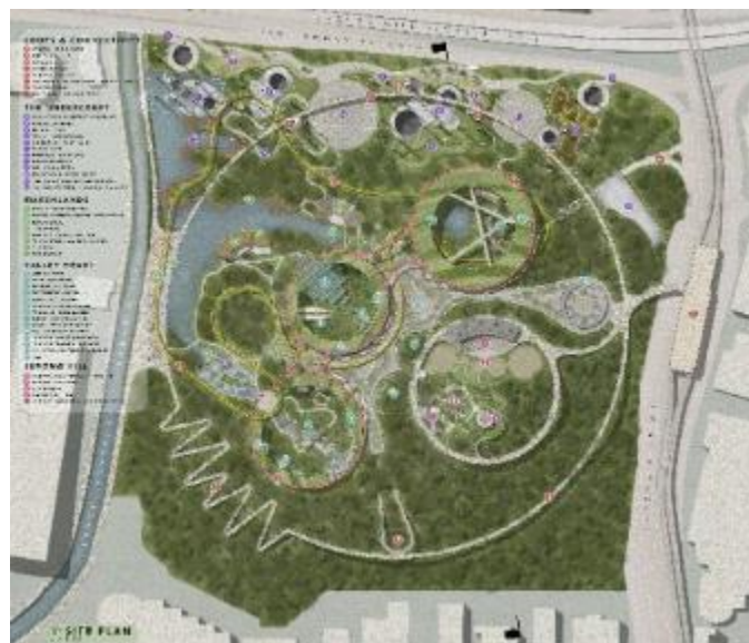
Illustrative site plan

Jurong Stratum aims to reconcile contrasts in Jurong's industrial landscape through layering, looping, and adjacencies, featuring three distinct loops that connect four main zones. The Undercroft houses the dense industrial developments along AYE that weaves in public spaces connected by the Central Loop. The Marshland centres around water-based activities, while the Valley Heart comprises three ring-shaped buildings supporting indoor recreational facilities. The Jurong Hill zone retains and enhances key heritage elements such as Jurong Hill Tower, creating spaces for community gathering and reflection on Singapore's development.