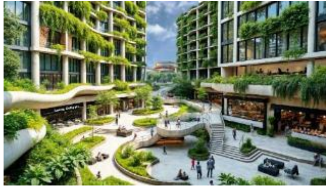
Incubation offices overlooking main promenade

10. Leveraging its proximity to NTU and industrial hubs in the west of Singapore, the Innovation Zone is envisioned as a hub for emerging businesses. Intensified office buildings are located closer to the AYE to buffer the communal spaces within from noise. Sungei Lanchar integrates nature-based retention ponds and stormwater solutions with a sunken seating area to form a multi-functional 'living room'. The Innovation Zone also includes amenities like restaurants to foster community bonding and support the wider Jurong Industrial Estate.