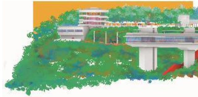
Jurong Hill Tower repurposed as a gallery

large-scale activities. Pedestrian and vehicular connectivity are also carefully segregated along a continuous central boulevard that anchors the proposal. Other community, recreational and commercial activities are interspersed throughout the rest of the site.