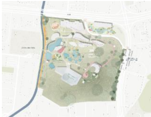
Illustrative site plan

Drawing inspiration from the site's past as a bird park, the proposal transforms the site into three interconnected zones: an Innovation Zone featuring business hubs and communal spaces for emerging businesses along Ayer Rajah Expressway (AYE), a Recreation Zone with supporting amenities such as a greenhouse-style wellness facility within the former Waterfall Aviary of the bird park and an Exhibition Zone housing a multi-level exhibition hall inspired by Jurong Hill Tower.