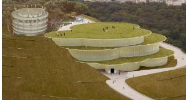
Jurong Hill Tower and multi-level exhibition space

data centre activities. Additional activity and relaxation spaces are provided in the lushly landscaped parkland around these features.