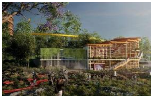
Former Flamingo Lodge given a tropical makeover

22. To support the working community, the Valley Heart is designed as a holistic environment for work and play. It is formed by three ring-shaped buildings — Activity Ring which houses the former waterfall aviary, Inclusive Ring that reuses the walk-in aviaries and Essentials Ring that takes advantage of the site's terrain. These rings are paired with indoor recreational facilities and are connected by the Garden Loop.