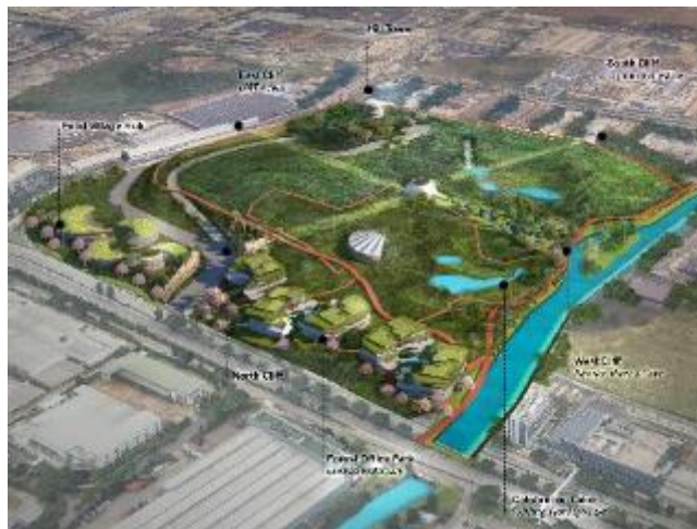
Illustrative site plan

17. Prioritising the protection of the existing natural habitats and heritage within the site, the proposal seeks to carefully balance the introduction of industrial and recreational uses through the activation of the site's vast underground space.