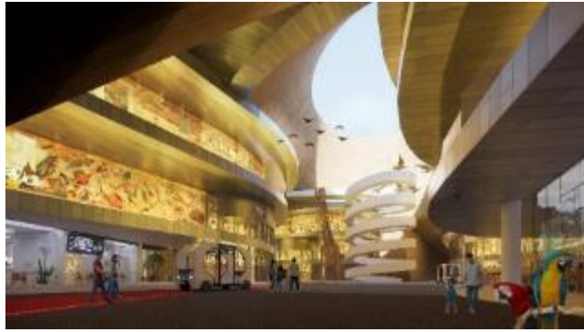
Underground cave serving as a hub for innovation and collaboration

17. Prioritising the protection of the existing natural habitats and heritage within the site, the proposal seeks to carefully balance the introduction of industrial and recreational uses through the activation of the site's vast underground space.