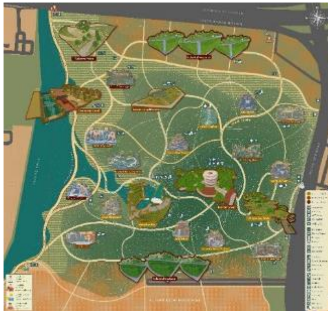
Illustrative site plan

The Jurong Philharmonic concept creates an 'acoustic oasis' that uses sound to shape the urban experience, with interventions mirroring orchestral sections that gradually transition from industrial noise to natural symphonies as visitors explore deeper into the site. Incubators, start-up offices and industrial developments are proposed along the northern and southern edges of the site while quieter uses such as community spaces are introduced through the adaptive reuse of existing structures like the amphitheater. Educational opportunities and family-friendly areas are interwoven across the site to foster community connection.