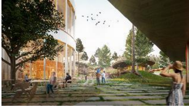
Festive food hub surrounded by a lush natural landscape

19. The edges are connected through tunnels that provide shortcuts across the site. Connecting the tunnels is a man-made cave centrally located within the site, that serves as a hub for innovation and collaboration.