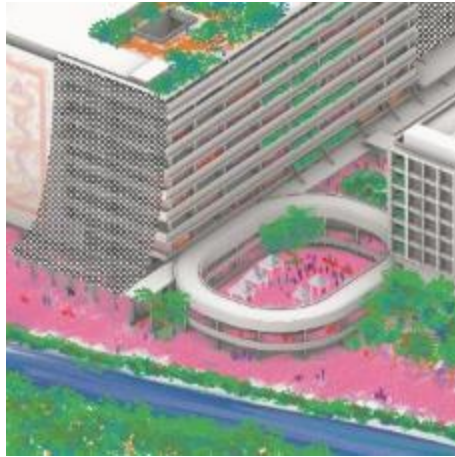
Illustration of The Box, The Ramp and The Screen

13. The proposal challenges the traditional concept of isolation by recognising that real-world usage of spaces is more complex and interconnected than their designated purposes suggest. The proposal sets out a framework that weaves together previously isolated spaces using three architectural elements (The Box, The Ramp, and The Screen) to create an integrated environment that supports creation, exchange, and showcase of Singapore's society, economy, and culture.