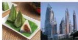
Reflections at Keppel Bay, as glutinous rice dumplings