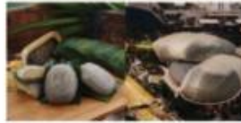
Esplanade, Theatres on the Bay, as Ang Ku Kueh (sweet dumpling)