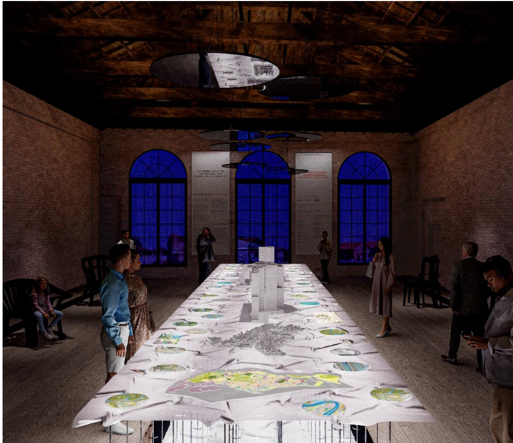
The table as a dynamic active participant in the performance of dining.

Above, mirrored disc lights reinterpret the chandelier, reflecting the table below and amplifying the space between. Suspended cameras and projectors observe and respond to the table scene. Within this sensory system, the table becomes an active participant in the performance of dining. Embedded sensors register visitors' presence, prompting shifts in lighting, projection, and atmosphere. The table shapes the dining experience, mediating between visitors' encounters with content and the responsive environment, inviting them to experience a thousand worlds within the Singapore Pavilion.