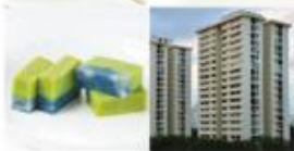
Public housing blocks, as Kueh Salat (custard on glutinous rice)