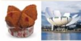
The Art Science Museum, as a Huat Kueh (steamed cake)