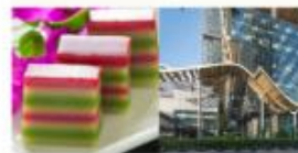
South Beach, as Kueh Lapis (sweet layered cake)