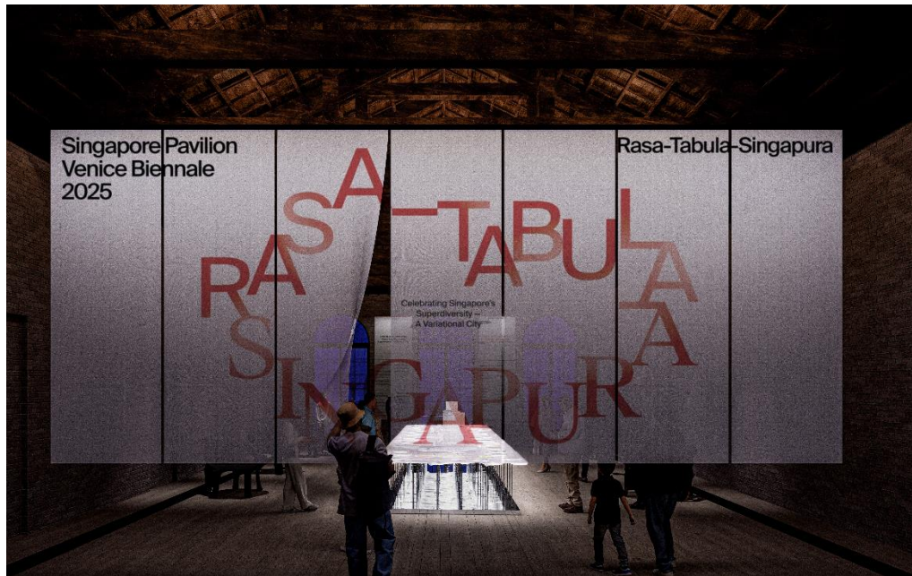
Arrival experience of the Singapore Pavilion

Dining—sharing and enjoying food together—is the metaphor that threads through the design of the Singapore Pavilion.