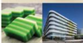
Singapore University of Technology and Design, as Kueh Lapis (sweet layered cake)