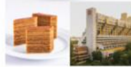
Golden Mile Complex, as Kueh Lapis (layered cake)