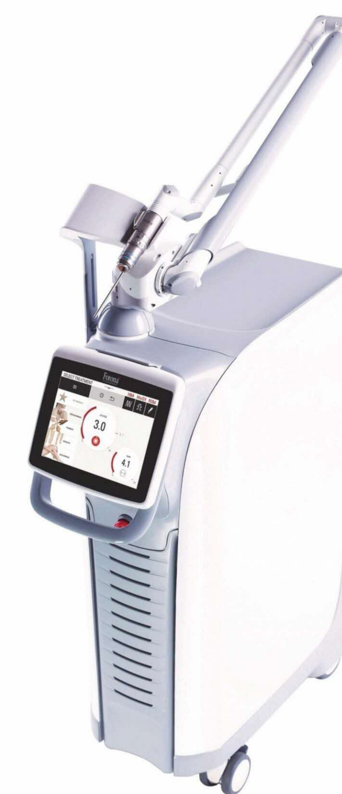
StarWalker ® MaQX Laser System

All parties involved worked with the target dates in mind and the first patient started treatment on time at the end of 2020.