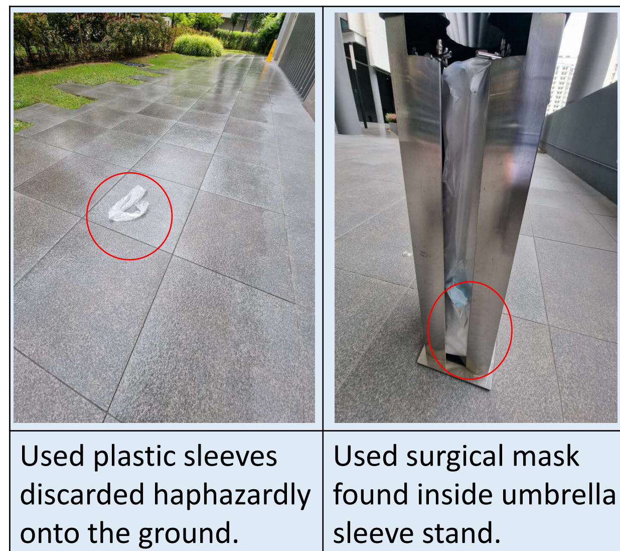
Used plastic sleeves discarded haphazardly onto the ground. Used surgical mask found inside umbrella sleeve stand.