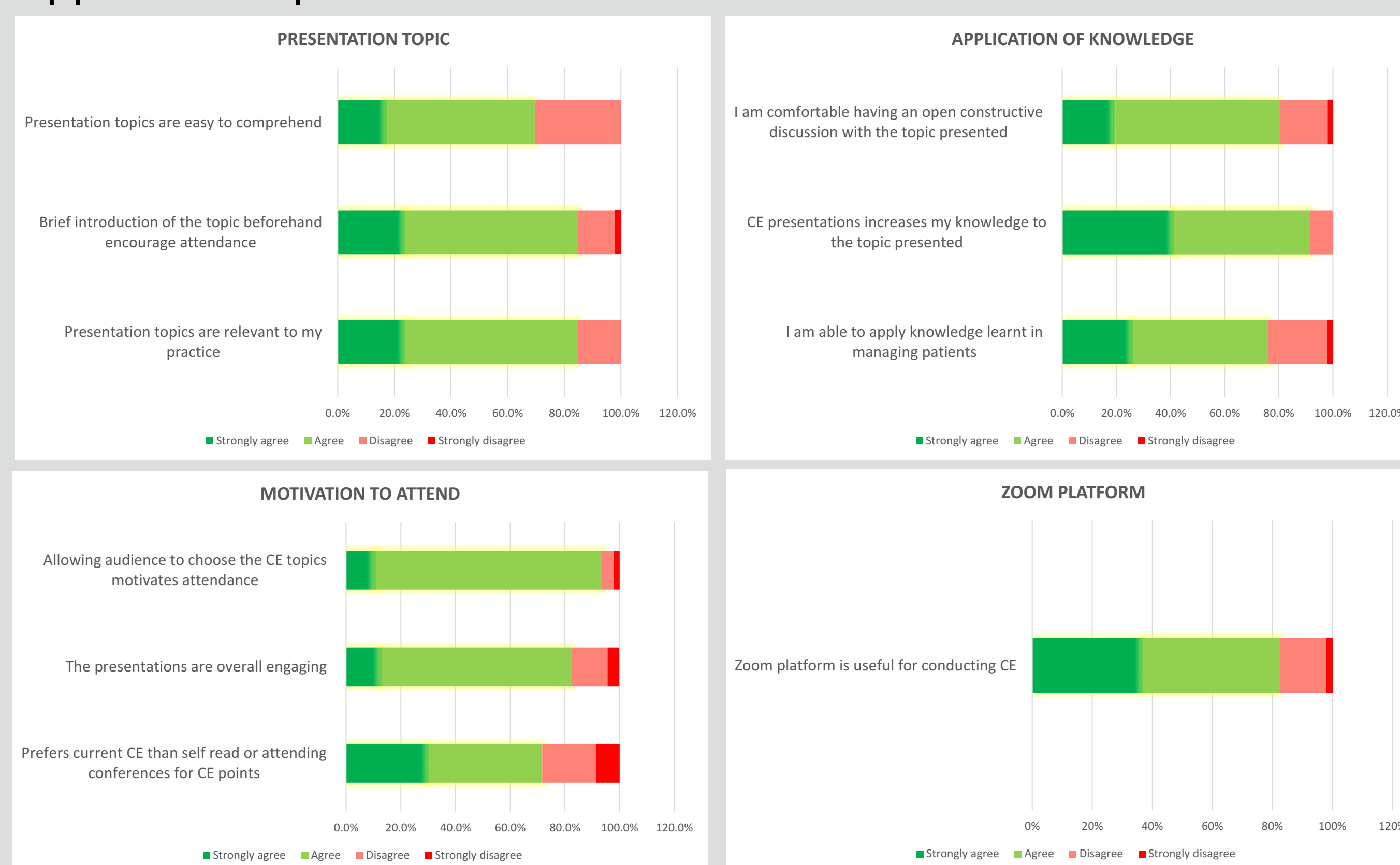
Figure 4. Post-implementation survey results

Based on the results of the post-implementation survey (Figure 4), more than 80% agreed that topics were relevant to practice. Eighty percent of the respondents agreed that by having a brief introduction of the topics beforehand had encouraged them to attend CPE. Almost 80% agreed that topics were easy to comprehend and were applicable to practice.