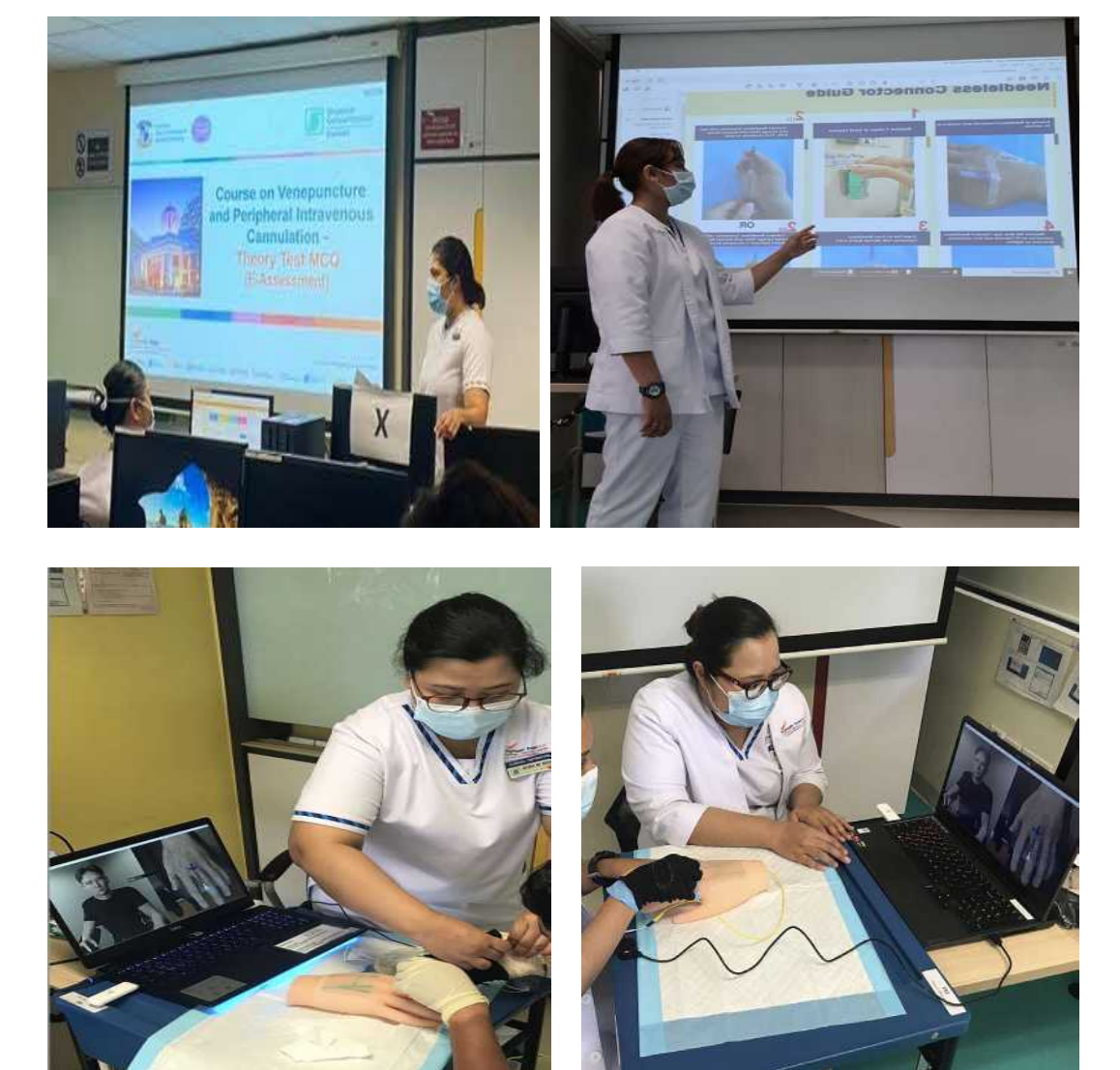
Photo 2-5: IV NIMBLE cannulation game was tested with newly hired nurses

The IV NIMBLE cannulation game was tested on 120 new nurses in July 2021. Each participant was timed on the total duration they spend on practicing and assessment of IV Cannulation. On top of that, all participants were given a pre and post training survey on their confidence level score and success rate of cannulation on a real patient to assess the efficiency and quality of the new IV cannulation training.