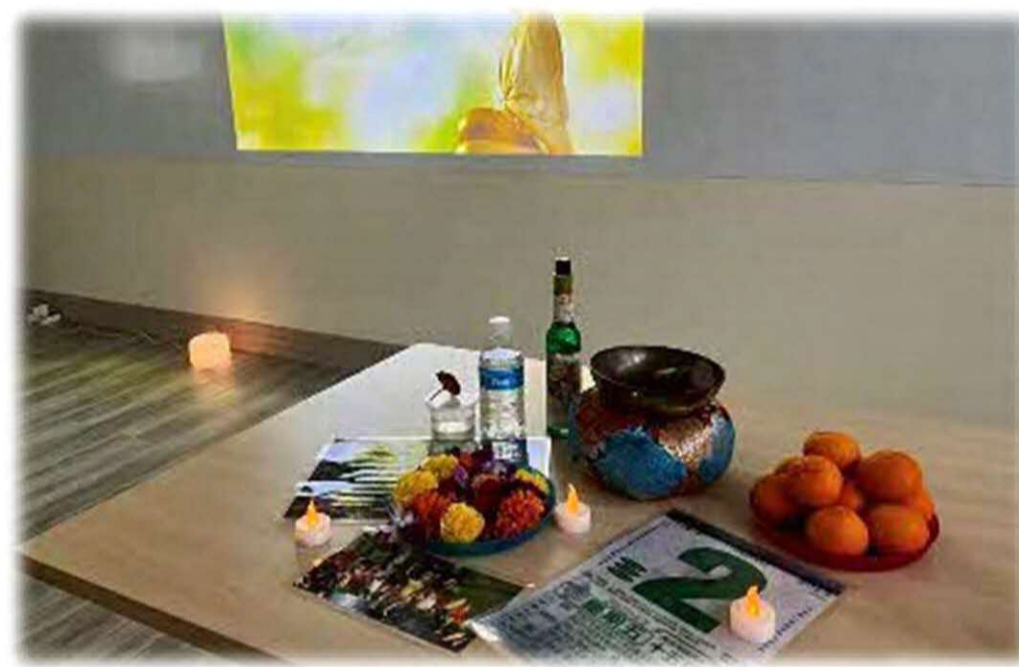
During Vesak Day, Buddhists residents are invited to pour water over baby Buddha to seek forgiveness, be blessed by scented holy water and hear the singing bowl as prayers are offered up for blessings.