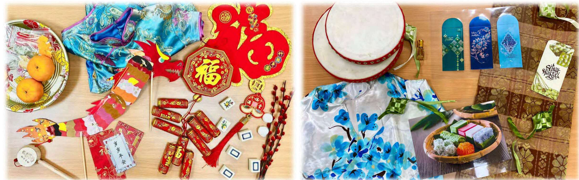
During Chinese New Year and Hari Raya, Chinese residents will exchange greetings with oranges, have lion dance to rid the bad and bring in new hopes with tossing while Muslim residents will seek forgiveness with green packets and interact with spices as they prepare dishes.