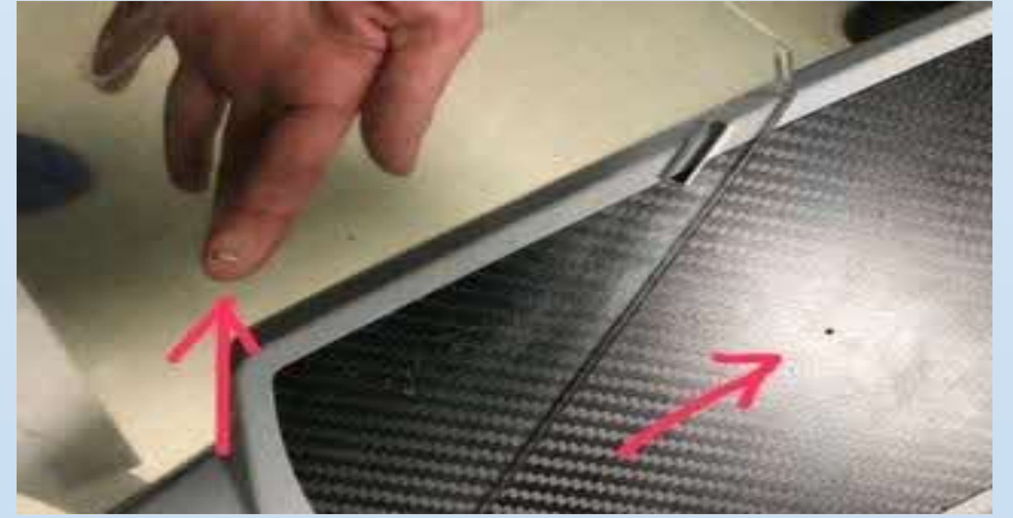
Holes on Mini C-arm detector and cover