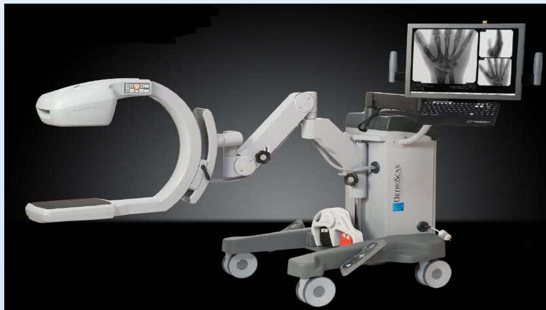
Full view of Mini C-arm

The Mini C-arm combines the components of a standard full-sized C-arm into a compact one-piece system designed especially for extremity orthopedic imaging. It is widely used in orthopedic surgeries especially in upper limb and foot/ankle surgeries.