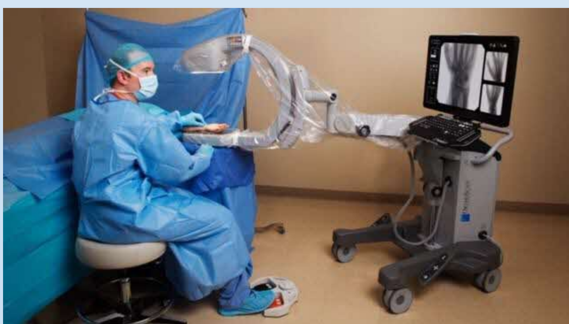
Upper limb surgery with Mini C-arm

Objective: Eliminate damage to Mini C-arm detector.