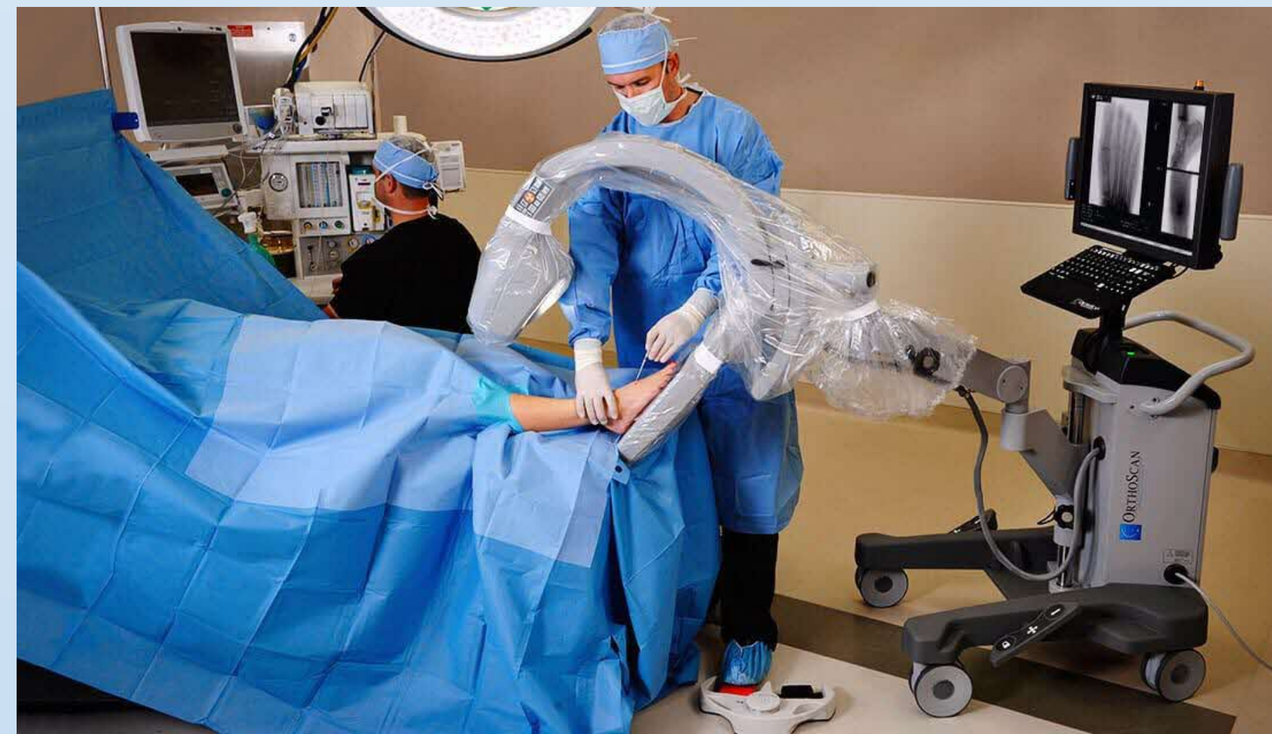
Lower limb surgery with Mini C-arm