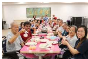
Fig 2: Participants and residents enjoy a steamboat dinner together

My Grandfriend lent me this book, she will return in 3 weeks to visit me. I finished the book and re-reading to revise, so when my Grandfriend comes back, I can summarize the story to her.