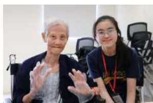
Fig 3: Grandfriends all geared up in gloves and ready to bake

The programme could be the much-needed solution to improve the psychosocial well-being of residents staying in a nursing home. Importantly, it is discovered that it mattered less who visited, as long there is someone to interact with the seniors.