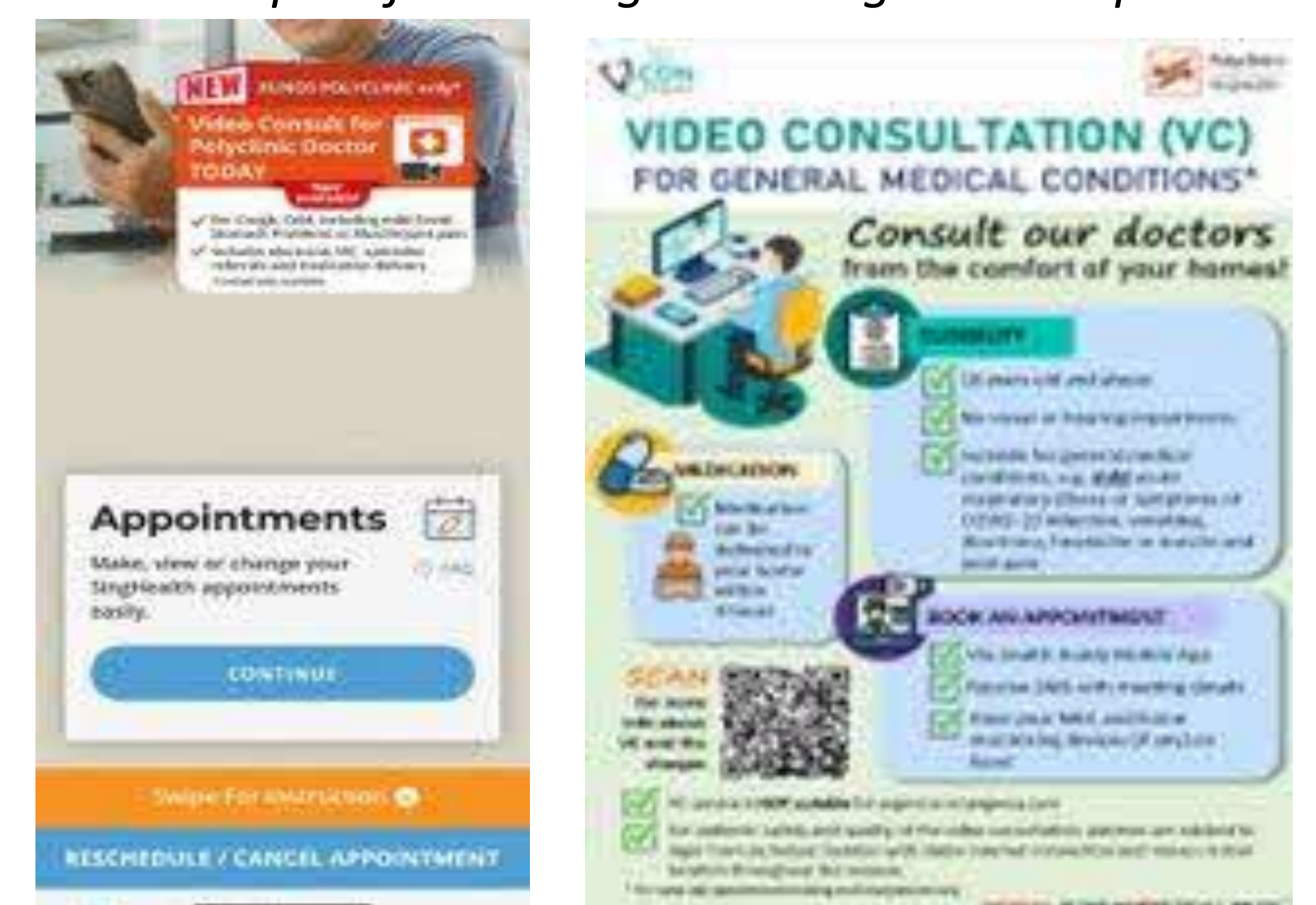
Publicity material to promote awareness of new service