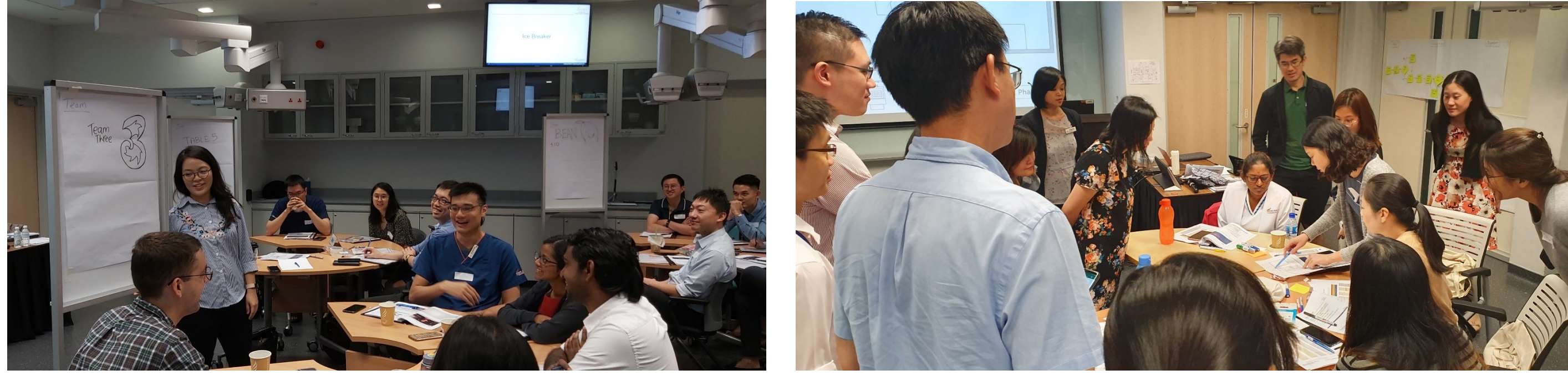
Fig. 1: Face-to-Face QI Training

Traditionally, Quality Improvement (QI) Training was done face-to-face (F2F) to allow interactions among learners to maximize learning outcome.