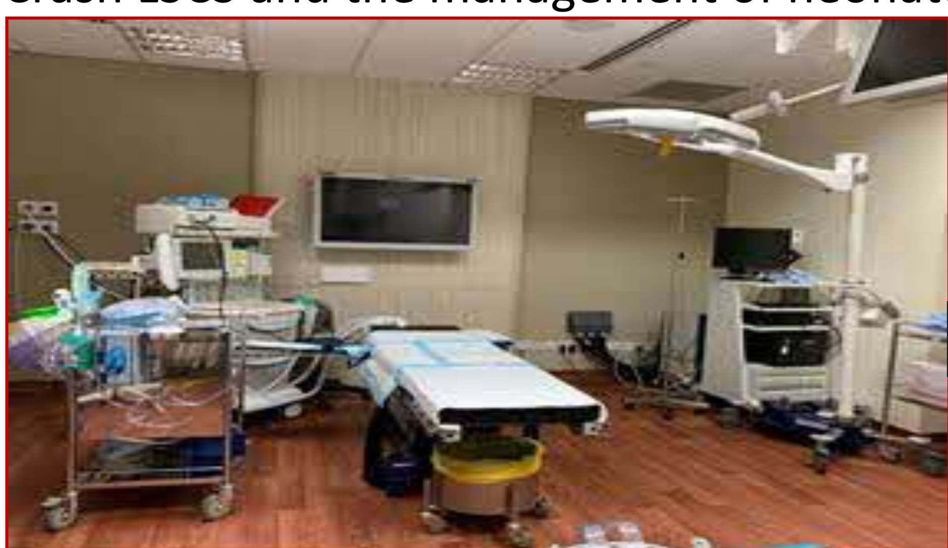
SET-UP of FSS

The FSS was then prepared and equipped to standby for Crash LSCS and the management of neonates.