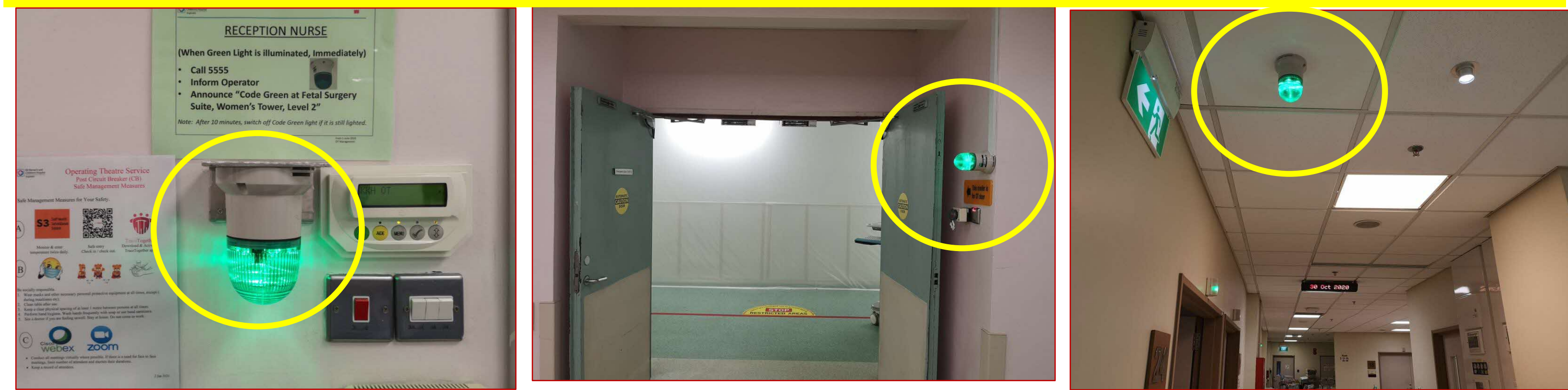
Women's OT Reception OT Emergency Door 2 Delivery Suite Corridor (ED 2)

Green light indicators will simultaneously be illuminated at Women's OT Reception, OT Emergency Door 2, Delivery Suite and NICU.