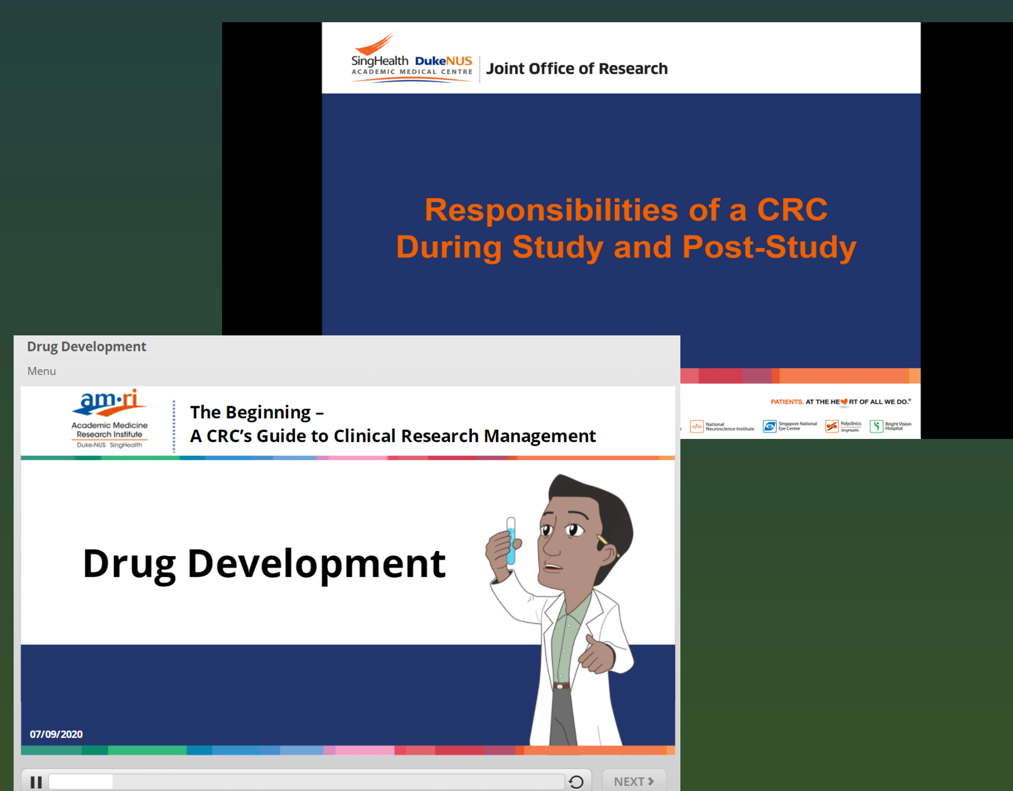
Figure 2: Screen capture of a self-directed e-learning module and zoom webinar

The change in the mode of training has proven to be successful. From this experience, CTCC has started the conversion of other training courses into full remote learning.