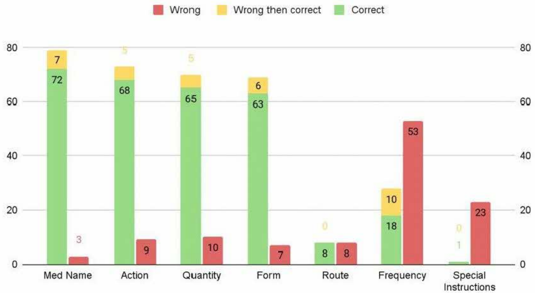
Figure 1: Accuracy for drug label recognition as of 13 June 2023.