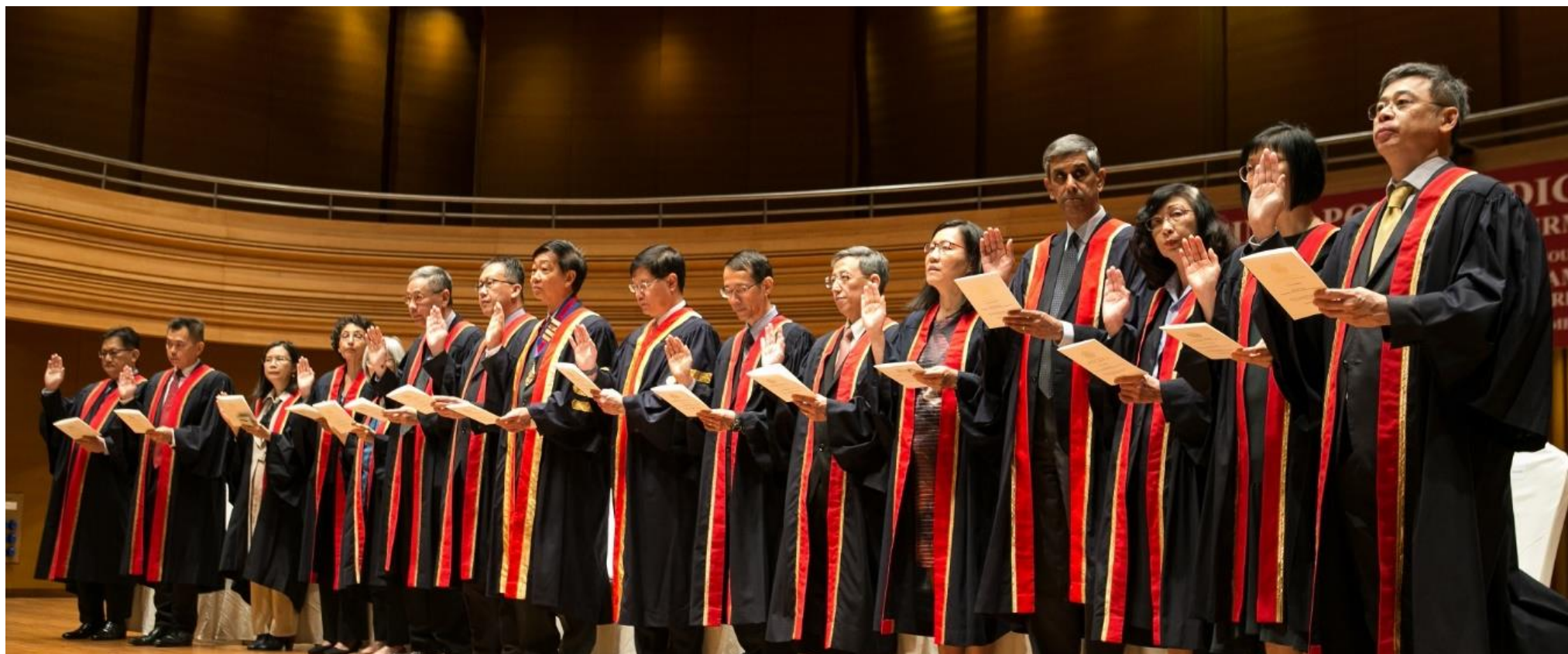
SMC members taking the Physician's Pledge with doctors

The medical fraternity has had members gone astray. Doctors have been imprisoned for dishonesty, selling addictive drugs and for sexual offences. Although in these instances it was the courts – not the SMC – which incarcerated them, the offences had repercussions on their fitness to practise eventually. The SMC is entrusted with maintaining professional standards within the medical fraternity, with a view of discharging our obligation to ensure patient safety. Hence, such medical practitioners who were found by the SMC to be guilty of professional misconduct, or have brought disrepute to the profession, have been sanctioned.