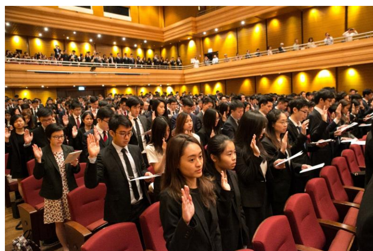
Doctors taking the Physician's Pledge

not merely a ceremonial requirement for full registration as required under the Medical Registration Regulations. When one seriously reflects on the contents of the Oath, one realises that the oath enshrines into our consciousness the collective conscience that as professionals, we have a code of conduct and practice that we should not deviate from.