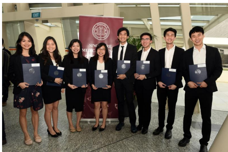
Doctors at the ceremony

This message is not limited to only the newly minted doctors but to all, regardless of seniority and years of service. It is important to re-skill to keep up with new medical research and knowledge. There is also a responsibility for all to be willing teachers and contribute to a positive learning environment in every healthcare institution so that others may also learn.