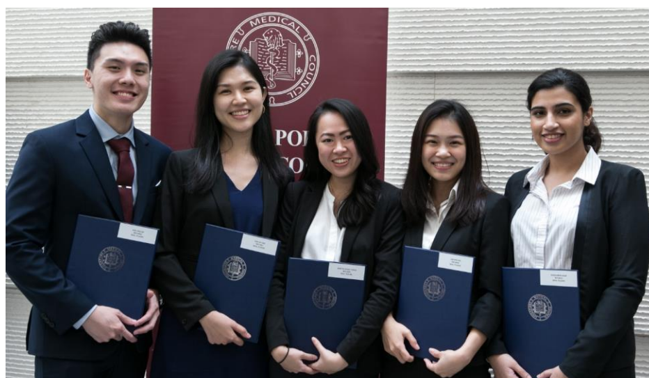
Doctors at the SMC Physician's Pledge Affirmation Ceremony, 28 September 2019