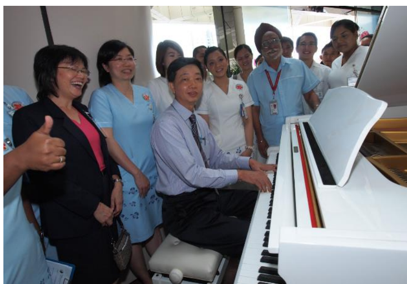
Serenading with TTS staff

Self-regulation by the profession is a privilege. It has been afforded to doctors by the public. This privilege comes with a heavy responsibility which behoves active participation by doctors towards maintenance of self-regulation. Towards this end, more medical practitioners need to step forth and serve on the various committees of the SMC. Of late, much publicity has been on the disciplinary process. This disciplinary process kicks in when something has failed, or when some persons felt the need to lodge a complaint. We can all agree that it is better for all parties concerned that everything goes smoothly (which is the case most of the time). However, clinical outcomes for patients are neither fully nor always within the control of the doctor in charge. Risks are inherent in most – if not all – medical procedures. As such, untoward outcomes are unavoidable. Patients are advised of the risks and they need to accept these risks.