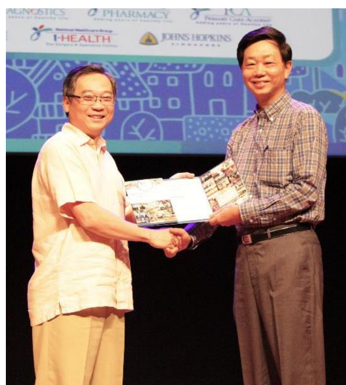
Receiving a token from Minister for Health, Mr Gan Kim Yong

The SMC will stay relevant to what is provided for in the MRA. In order to protect the health and safety of the public, the SMC needs to ensure high standards of ethical medical practice. It does so by ensuring that doctors who enter, and remain in practice are well trained, and continue to maintain competence and display high ethical standards. For those who fail to do so, there are due processes to deal with them. There are appeal processes provided for should the doctor or the patient feel that their concerns have not been adequately addressed.