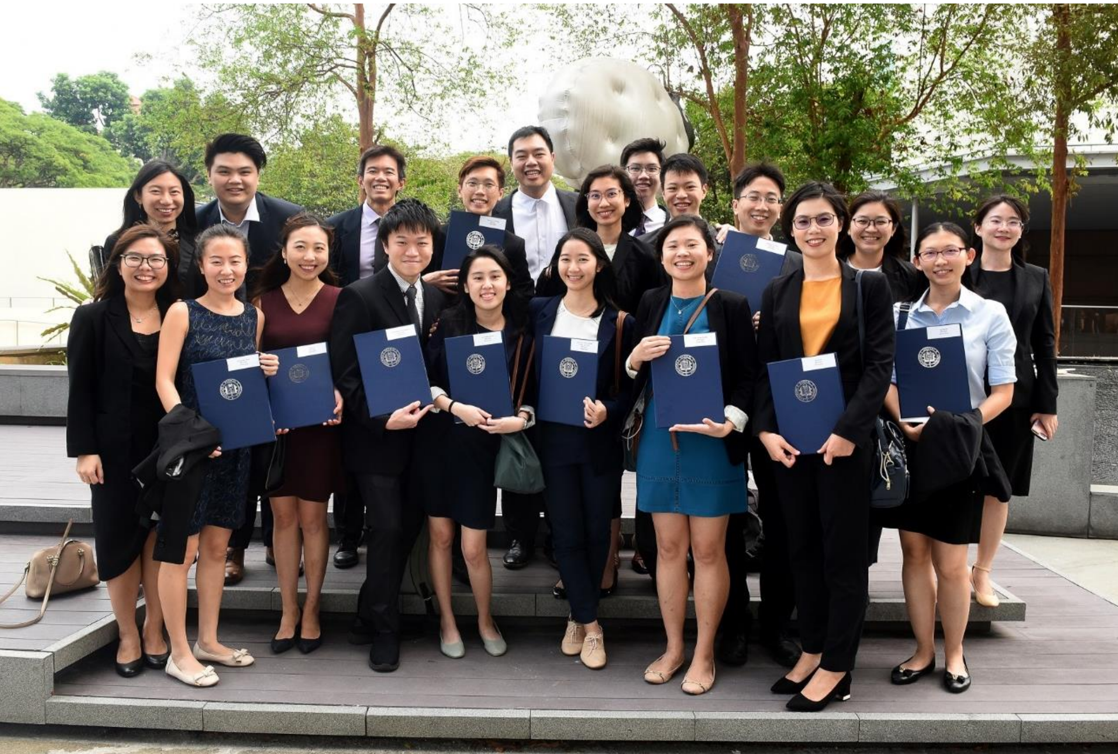
Doctors at the ceremony