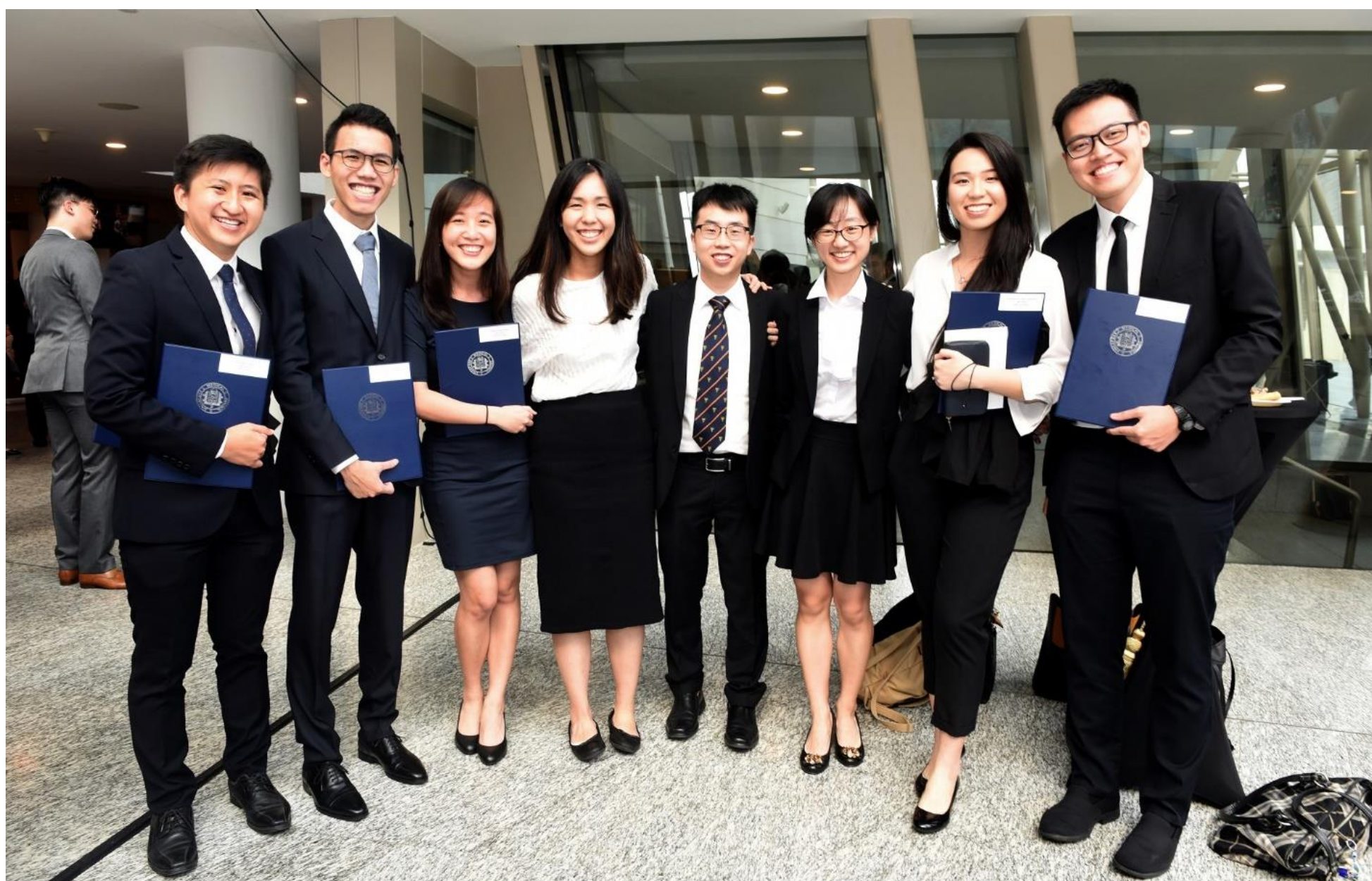
Doctors at the ceremony

Prevention is better than cure. So instead of putting more and more resources into disciplining doctors, we should channel more resources into educating them.