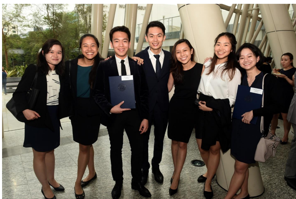
Doctors at the ceremony

SMC can publish educative resources, but will doctors have time to read them? So SMC cannot do this alone, it must have the support of our medical schools to choose the right students, to teach ethics and professionalism, to enshrine ethical management in every case discussion. SMC must have the support of our professional bodies and I am pleased to see the Master and the Presidents of our professional bodies, or their representatives, here because they have supported the SMC in many ways. They are in this journey with us to create a better system, with better training and better Continuing Medical Education. These measures will lead to better doctors who will in turn benefit society. Over the decades, the SMC with the professional bodies, the Academy of Medicine Singapore, the College of Family Physicians Singapore and the Singapore Medical Association have worked closely to maintain the competency and quality of our doctors through CME programmes.