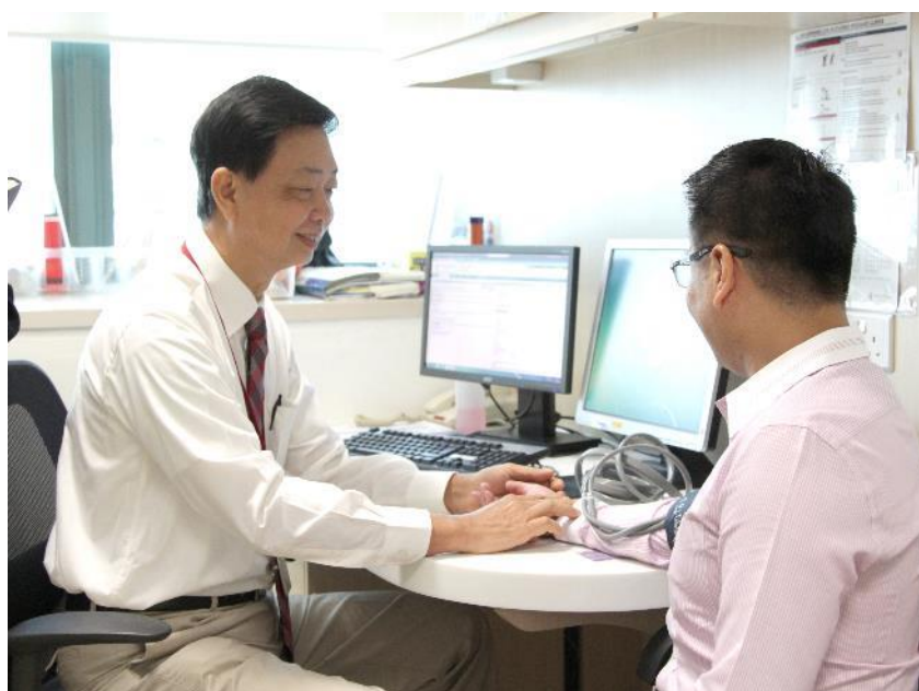
Consultation with patient

It is important to deal with the issues at hand first to ensure that medical practice is safe and of high ethical and medical standards. Doctors should be confident that when they do their best to serve their patients' needs, the decisions of the patients matter. To help patients decide their care management, doctors will need to communicate effectively with charts and drawings, if necessary so that patients truly understand the treatment proposed.